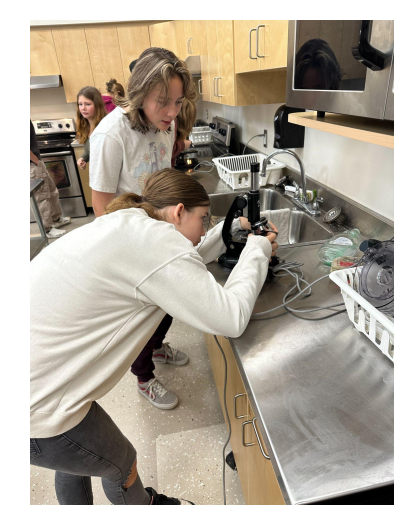
Grade 9 Science in Action!