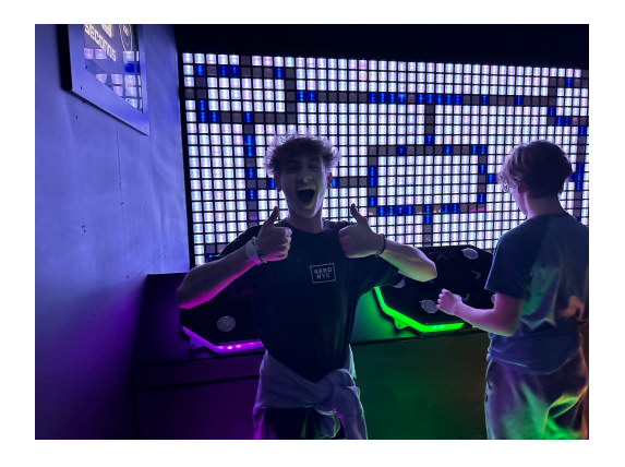
Grade 8 & 9 Start Up Trips! Activate and WEM